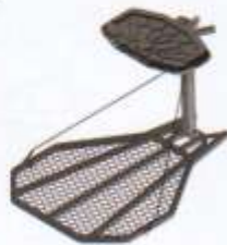
GORILLA TREESTANDS SILVERBACK MAGNUM HX

Contact: Gorilla Treestands, Dept. PB, (877) 685-7817; www.gorillatreestands.com .