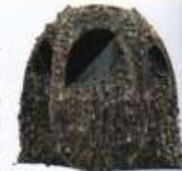
GORILLA GEAR QUICK STRIKE PRO BLIND

Contact: Gorilla Gear, Dept. PB, (810) 733-6360; www.gorillablinds.com .